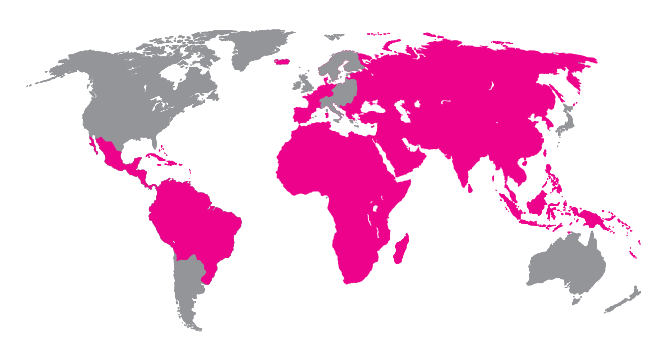
In 1985, when Rotary began its pledge, there were 125 polio endemic countries.

Polio is a crippling and potentially fatal infectious disease which Rotary has been working hard to eradicate globally since 1985.