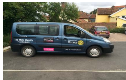
Project Sponsors and Rotary logo on the Hour 5 Seater transport vehicle.

Hour Community was set up by the Rotary Club of Framlingham 5 years ago in response to residents' requests for help around the home.